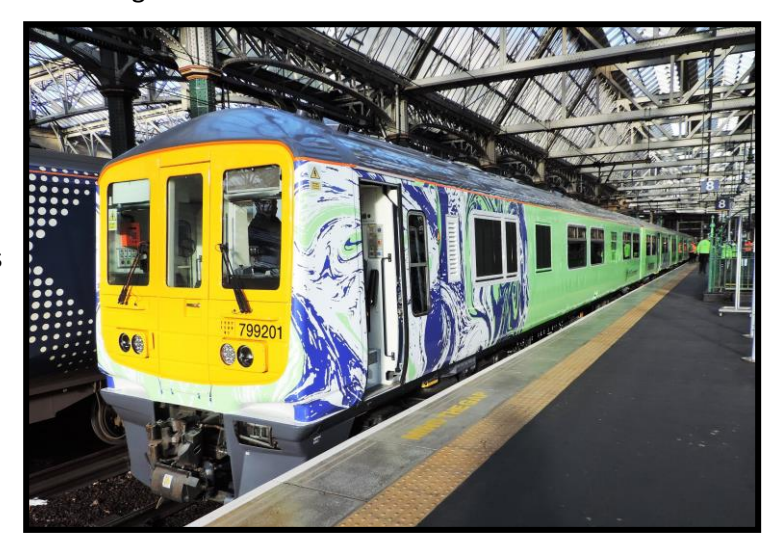
Hydroflex hydrogen/electric train (above) and VivaRail battery train in Glasow Central.

A Hydroflex hydrogen/electric train (a Class319 electric multiple unit converted by train leasing company Porterbrook) gave demonstration runs round the Cathcart Circle during COP26. To allow hydrogen tanks and fuel cells to be viewed by delegates on the trip, the tanks were empty and the train used 25kV/AC power. The hydrogen tanks and fuel cells give a range of 600 miles on hydrogen. The tanks fully occupy one coach of the four-coach train, which could be a consideration on single-track lines where overall train length is limited by the length of passing loops.