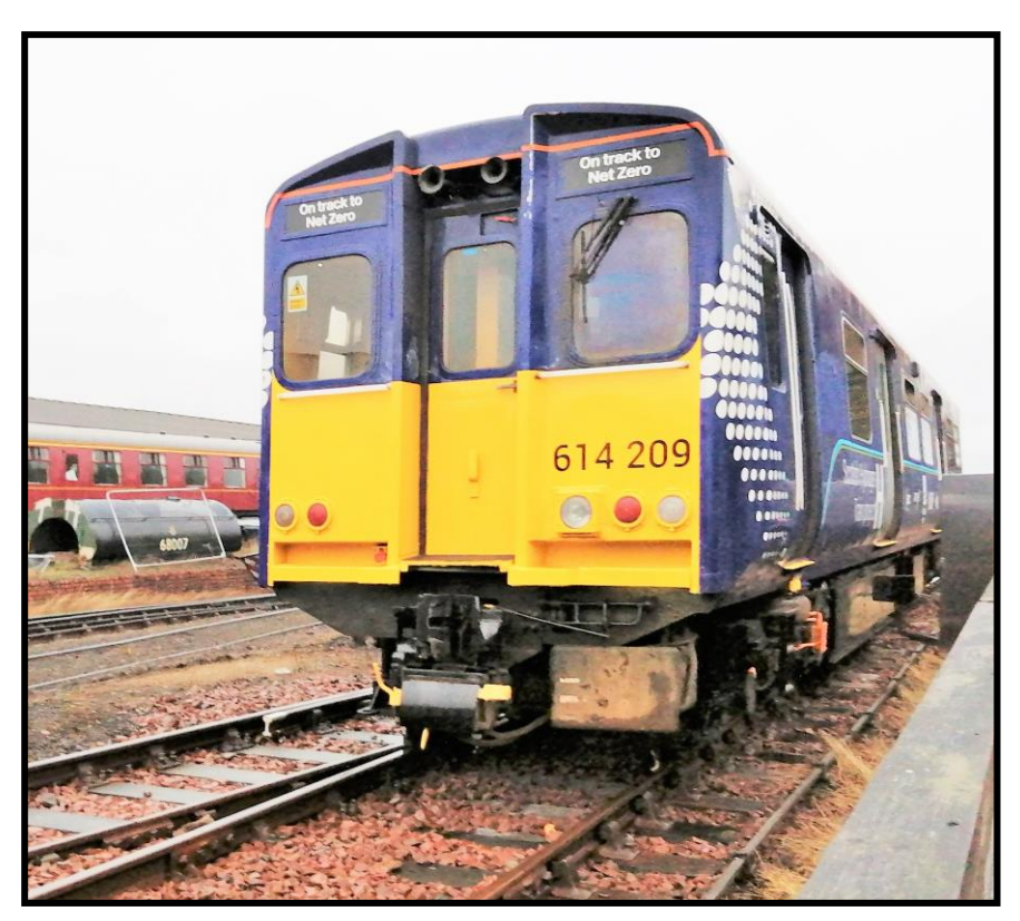
A Class 314 is being converted to hydrogen fuel cell power (reclassified Class 614) at the Bo'ness and Kinneil railway workshops by a consortium led by Arcola.

Hydrogen fuel-cell stacks have a sluggish response to demand for power level changes. Their efficiency depends on the operating condition. Powertrain control strategy may therefore involve fuel-cell operation with slow rates of change, with fast dynamic changes and peak loads being supplied by the battery pack.