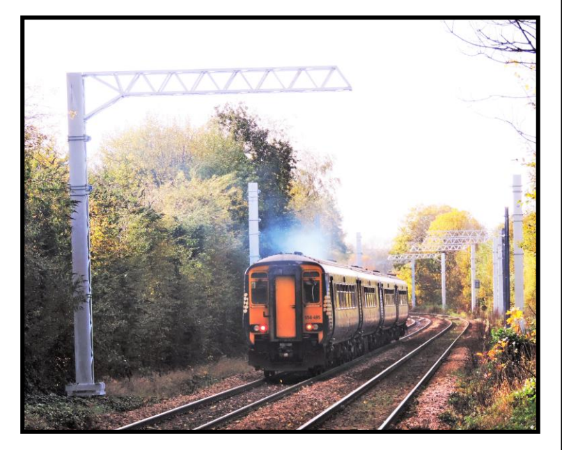
Transport Scotland has a rolling programme of electrification. Overhead gantries are already erected at Crossmyloof (above) on the electrification scheme to Barrhead and East Kilbride as a smoky 4-car Class 156 leaves for East Kilbride on 9/11/21.

Plans are being prepared for electrification of lines from Edinburgh to Fife and Tweedbank. Hopefully these lines can be fully electrified so no heavy batteries will be needed in trains.