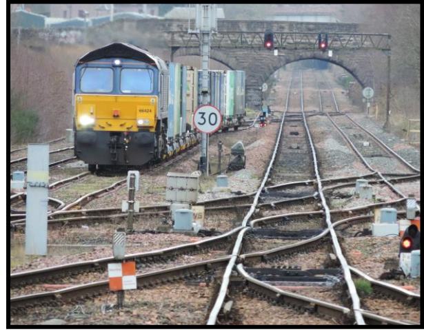
Track and signalling at Perth need upgraded. This view is the main line south of the station.