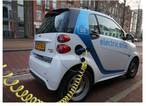
Will a move to electric cars increase the popularity of lightweight vehicles?

publicly funded capital grants are made available.