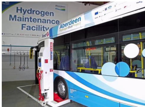
Aberdeen has pioneered a hydrogen bus